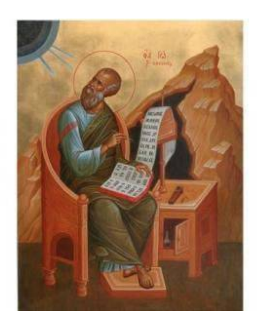
\begin{array}{c} \text{Interpretation of} \\ 5^{\text{th}} \text{ and } 6^{\text{th}} \\ \text{Trumpets} \end{array}

Blessed is he that readeth, and they that hear the words of this prophecy, and keep those things which are written therein: for the time is at hand.