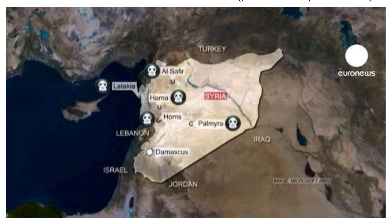
Fig. 8. Poisonous gases used for chemical weapons