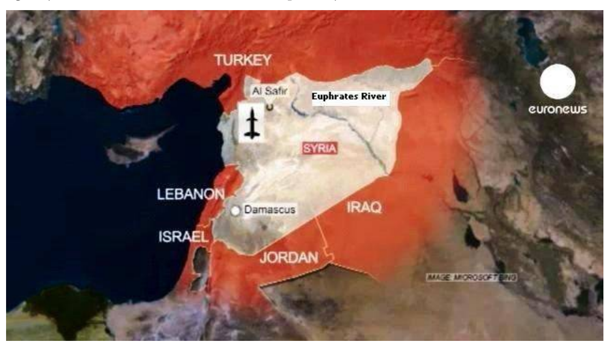
Fig 6. Syria. The area where the chemical weapon may be available is marked red.

civilians. The situation is further complicated by the fact that Syria produces biological and chemical weapons.