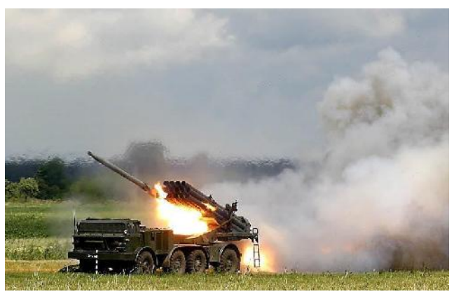
Chapter 9, paragraph 19

9:19 For their power is in their mouth, and in their tails: for their tails were like unto serpents, and had heads, and with them they do hurt