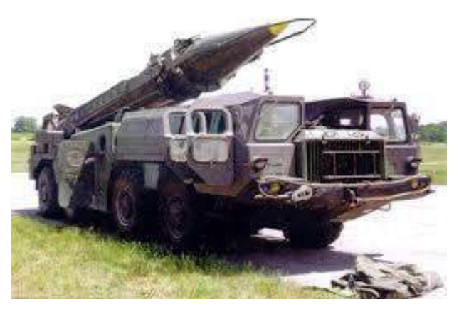
Fig 10. Different color of armor envelope