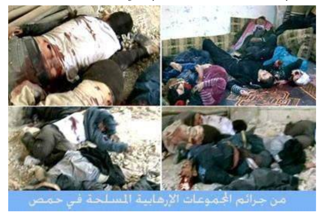
Fig. 8a Population died as a result of use of chemical weapons

inevitable. So far, the chemical weapons used by the Syrians not against neighboring countries, but in the internal conflict, has led to terrible results. Hundreds of people died, including many children.